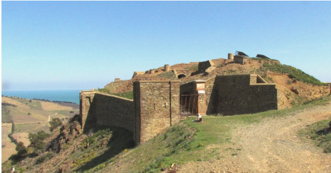
Batterie de la Galline

torrent joins. (These deep ravines in summer months form the track of the walk but in winter they are full of water)! Here, turn sharp left and follow upstream for about 25 metres, and then sharp left again for about 5 metres where a wooden plank crosses the third stream course.