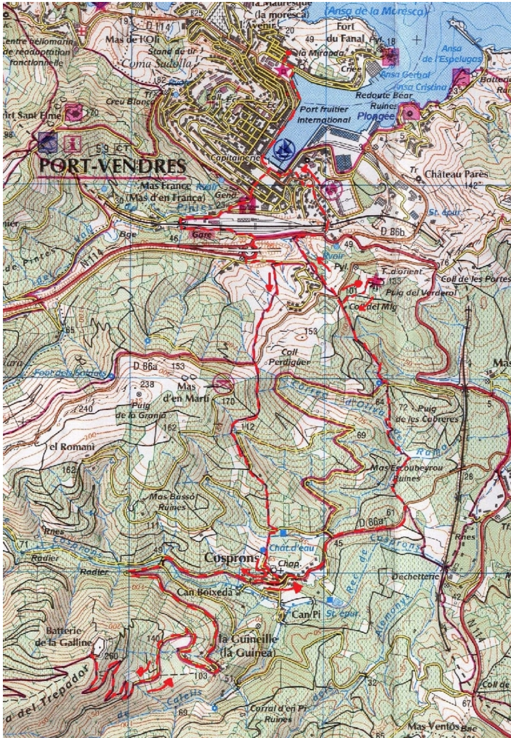
Walk – Port Vendres to Batterie La Galline and back