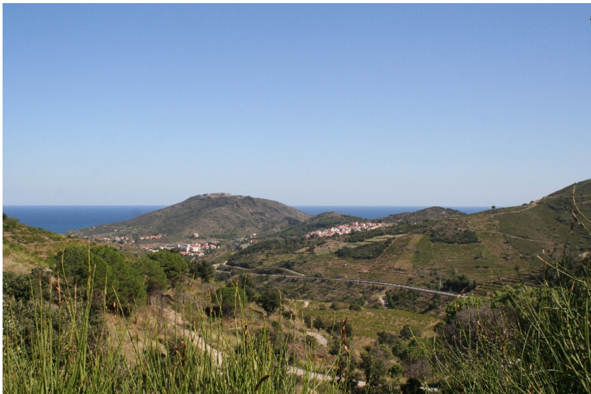
Val de Pintes & hinterland behind Port Vendres from the top of the Val

As the steep incline levels at the top of the Coll d'en Raixat, walk a few metres to the right to the road junction and fabulous views can be seen over Collioure and the Plain of Roussillon to the North and back down the Val de Pintes. Close in front to the North East Fort Dugommier rises high with Fort St Elme beyond whilst the two tours of Massane and Madeloc, crown the ridges high above to the North West and South West respectfully.