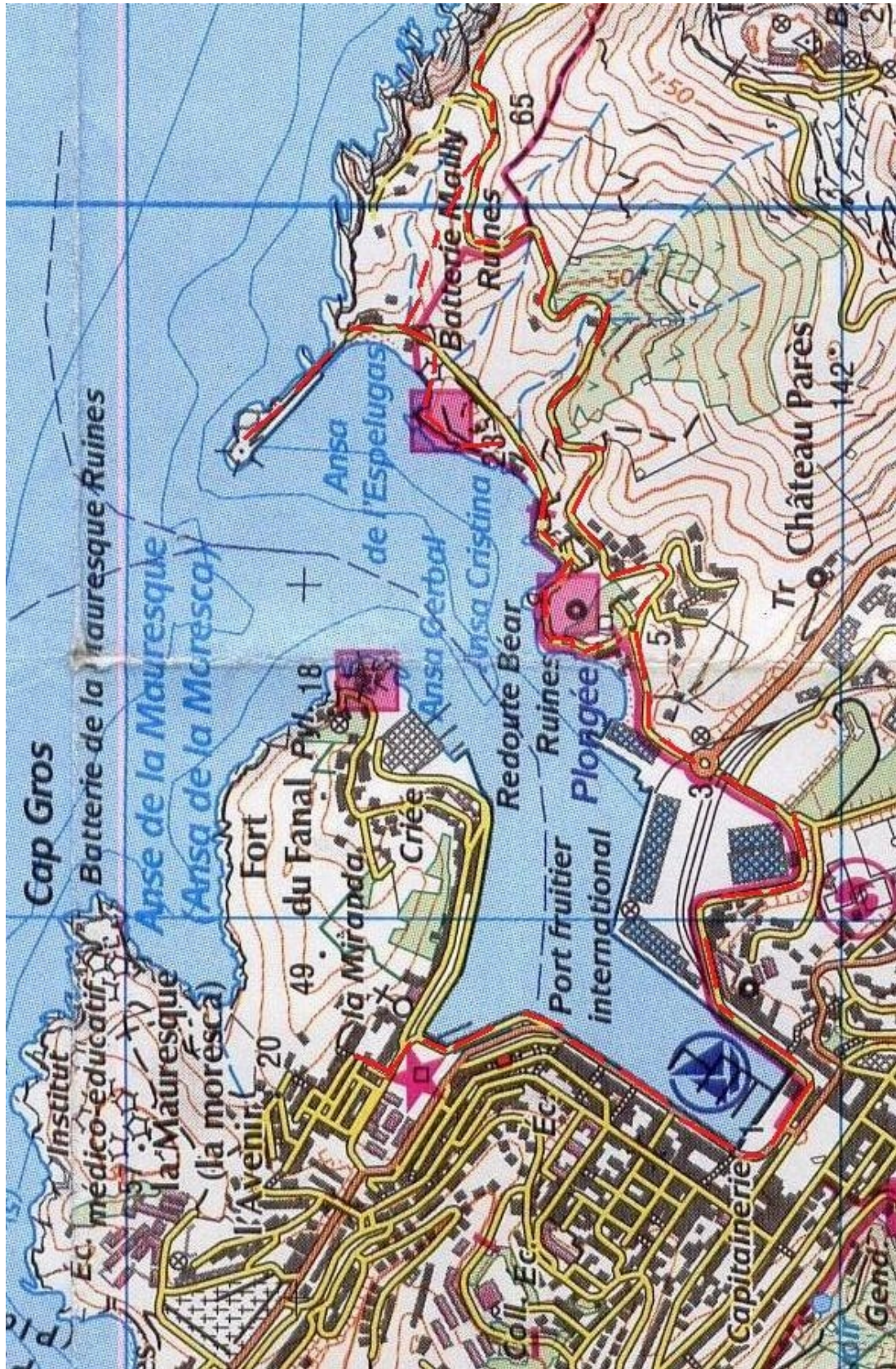
Map of Walk "Anse de l'Aspulgas & le Feu du Mole"