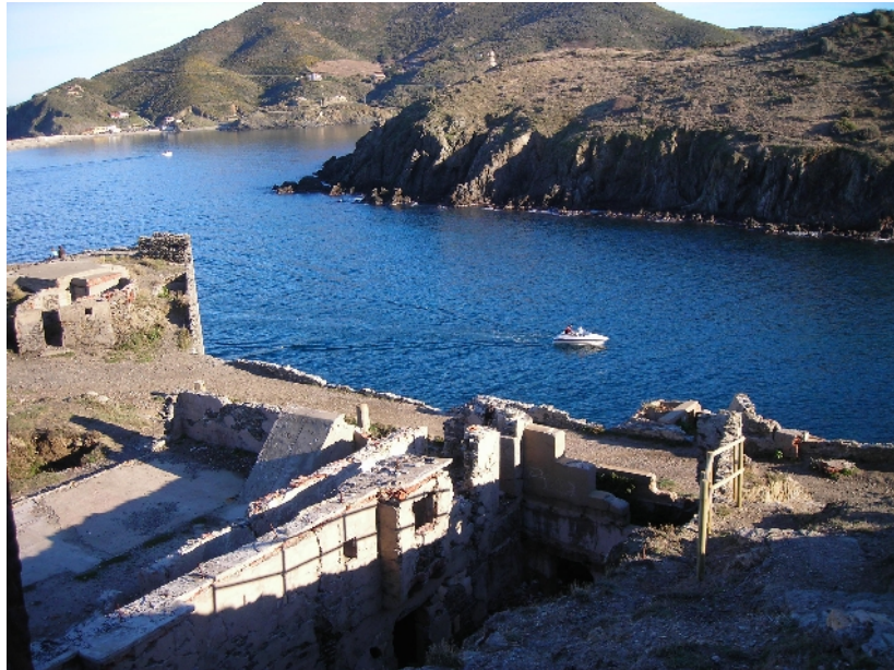
Batterie de la Mauresque, Port Vendres

It is worth spending time enjoying the views to Collioure and beyond, to Tour de Madeloc and then to appreciate the full extent of Port Vendres' charm from the tip of this headland. Take the footpath back along the edge of the cove Anse de la Mauresque, where a token to Charles Rennie Macintosh marks the site with a copy of one of his drawings in the 1920s of the crumbling fortress. Within a few metres, a simple footpath drops down to the cove, (a favourite spot for rock diving), and then beyond, taking the footpath up again along the edge of the second rocky headland; Fanal. Follow this path across the headland to its highest point and the views across the bay to the steep hills of Fort Bear are well worth the effort. The path then drops down to civilisation with steps down to Rue la Miran. A detour to the left leads to the lighthouse at Redoute du Fanal, (a further reminder of Vauban's magnificent military engineering at the end of the 17 th century). Retrace back towards Port Vendres along the Rue la Miran and then very soon on the left, overlooking the Crie de Poissons, is a charming quiet memorial garden Square Henri Bes Jardin de l'Abatoir, sacred to the memory of the inhabitants of Pyrenees-Orientales who died in the almost forgotten Algerian War.