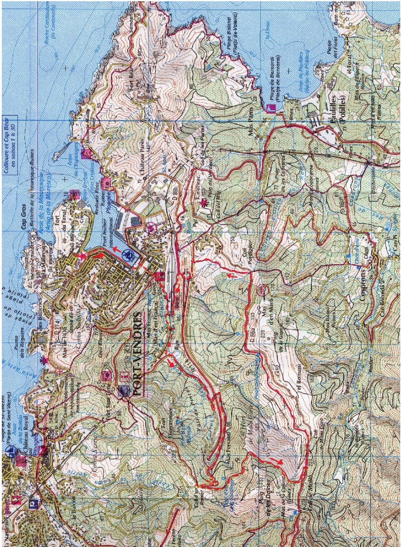
Map of Walk : "Vall de Pintès" or "The Mackintosh's Enchanted Valley"