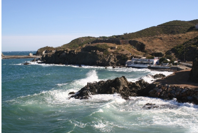
Anse Christine with Poisson Rouge on beach & Batterie Mailly above

the corner where there is a rugged track descending to a scattering of homes. The views down the cliffs to the ocean and rocks below, over Port Vendres and beyond are spectacular.