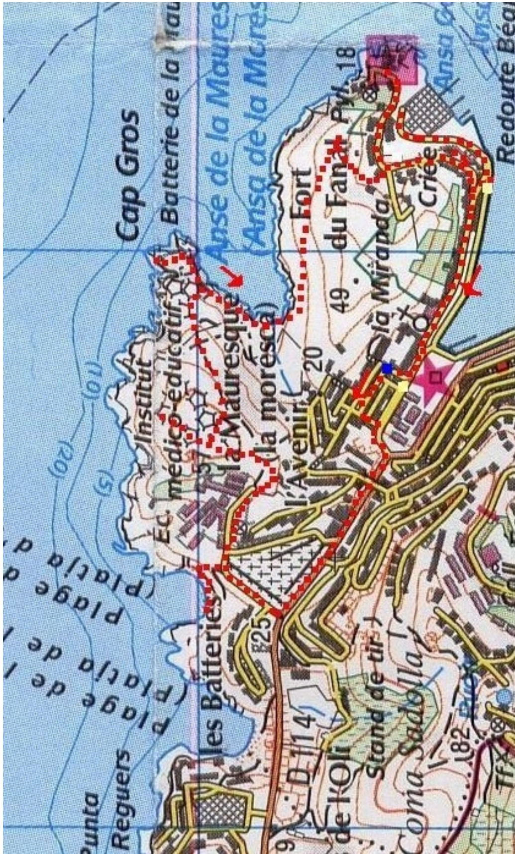
Map of Walk "La Mauresque & Fanal"