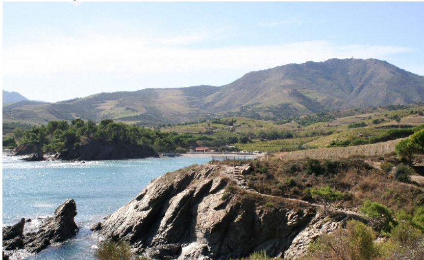
Plage de Bernardi & Tour de Madeloc from the headland above Plage Balanti

the horrors of war that should never be forgotten and home now to countless sea birds. Returning back up from this lonely place pick up the path again to the left of the Phare but take care – it would seem it drops off the side of the world and precariously clings to a rusty fence as it descends literally over the rugged cliff face. When at the beach, the path lifts up again between the houses and emerges through more mature cacti, over rocky out-crops on to a strictly coastal edge track. This is not for nervous or physically challenged walkers, particularly on windy days but it is a beautiful and bracing walk along some of the most spectacular coastal cliffs winding in and out and up and down. There are a couple of beautiful and isolated beaches that are crossed (the larger cove being called Plage Balanti) which after only a small distance in between settles on a wide smooth one (Plage de Bernardi) accessed by road from the RN114 and where in summer months refreshments can be obtained from Sole Mio – oh, yes! There are toilet facilities here.