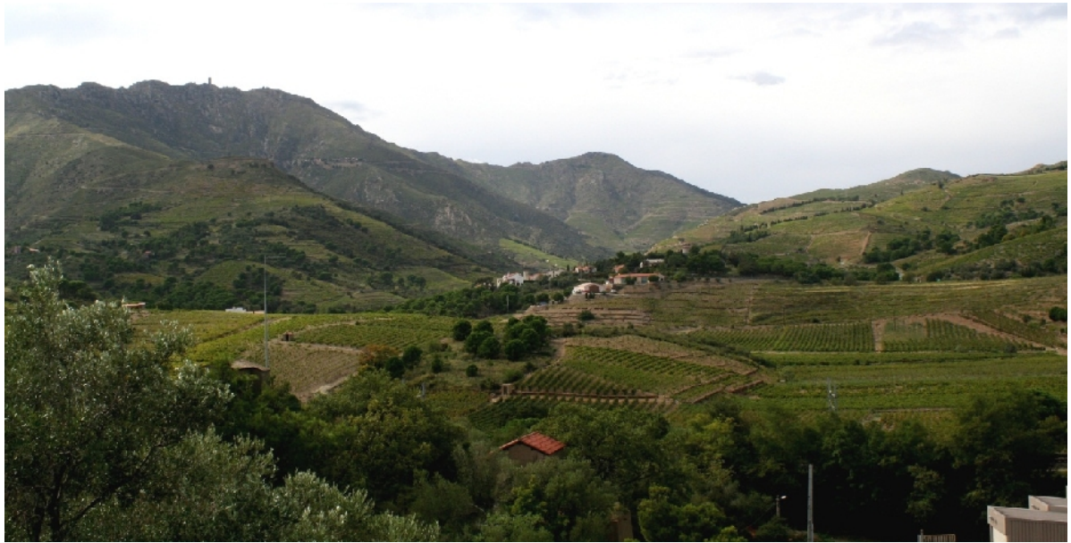
Batterie de la Galline nestling beneath Tour de Madeloc with Cosprons in foreground

immediately before the road. Climb up over the concrete barrier and turn right with caution, keeping close to the barrier on this busy stretch of road but it is only about 100 metres. When traffic permits, cross over the road and at the corner of the next junction, opposite the Hotel Le Cedre, follow the road down into the village to the next cross roads, take a left turn and then the steps down on the right. Cross over the main road and down the next flight of steps to the harbour, which can be followed back to home.